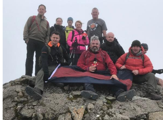
Other team members on the Summit of Ben Nevis.