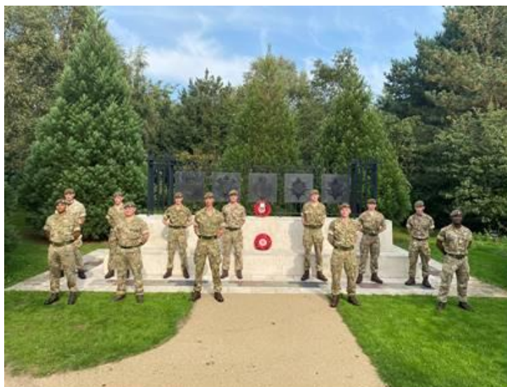
Trainee Guardsmen soon to be Grenadiers from 20 Platoon on a visit to the National Memorial Arboretum.