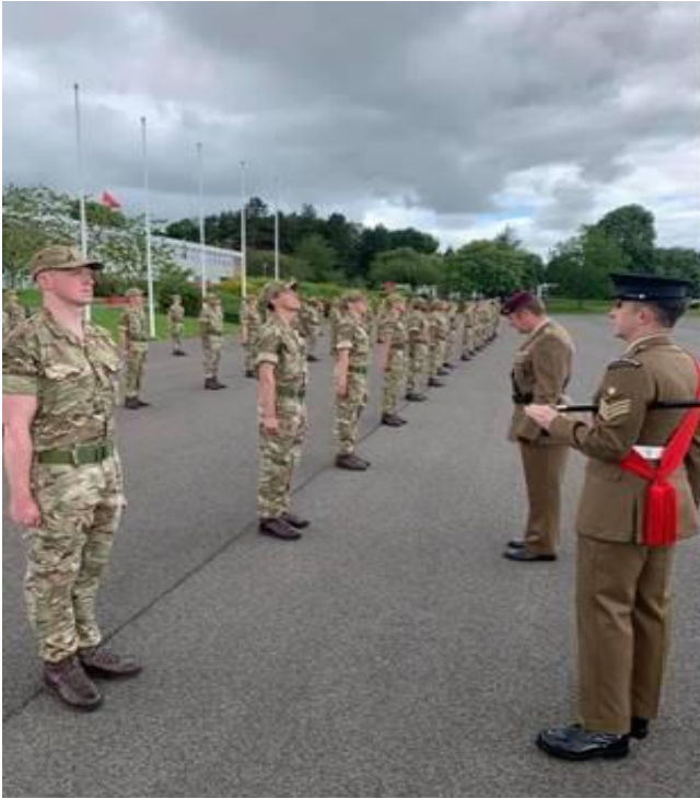
Adjutants inspection at the end of the basic phase. Upon passing, the recruits will receive their regimental headdress