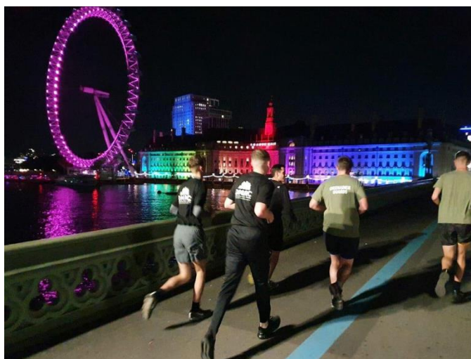
Members of 5 Pl raising money for the DMRC Benevolent Fund

To break up the week-long guard rotations, the Company deployed on a summer exercise to Sennybridge Training Area, Brecon, in July. The two-week exercise sought to develop confidence in navigational ability and basic soldiering skills, as well as to conduct a day and night live-firing package up to section level. The exercise provided a great training opportunity, with a particular highlight being the Platoon Patrol Competition at the end of the first week. This involved a 45km march around the perimeter of the training area, with four challenging command tasks spaced out at checkpoints along the route.