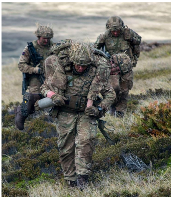
A CASEVAC during Ex CAPE BAYONET

After a great deal of build-up training, the beginning of the year saw the company deploy to the Falkland Islands to complete Ex CAPE BAYONET, a demanding live firing exercise on the unrelenting Onion Ranges. This provided a fantastic opportunity for young Guardsmen to conduct platoon and company actions under the guidance of high-quality NCOs, with a particularly memorable river crossing and helicopter insertion that many will not forget in a hurry!