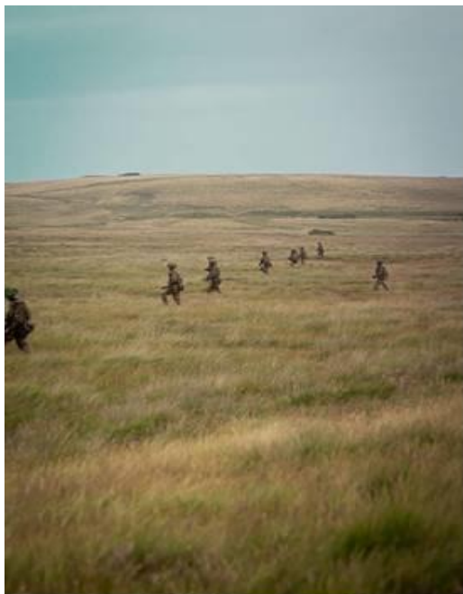
Patrolling in extended line on exercise.

The ever-evolving Combat Infantryman's Course (CIC) has been very successful over the past 2 years and further developments have been made to see the introduction of the CIC 21 in the new year. The structure of the CIC 18 will remain but the new course will pay more attention to current operational outputs, for example instead of just conducting the pistol weapon handling test, recruits will receive further training on the weapon system and conduct the Annual Combat Marksmanship Test. This new course will see our Guardsmen even more ready for the Army's future operations than they already are.