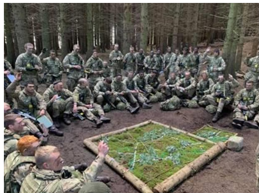
Receiving a set of orders for an Ambush

Instructors and recruits have had to adapt training to accommodate all of the Coronavirus mitigation measures. This has proven challenging in many of the training aspects in particular the field exercises, especially the URBAN exercise but it has not hindered the key training outputs that ensure our Guardsmen are at the standard to join the field army as professional soldiers. Unfortunately, it has meant that many of the Trainee Guardsmen have missed out on visits such as the Week 5 Parents' day and the Week 4 London visit where the trainees get an insight into life in London District. However, this has pushed us to move with the times and make the most of numerous online tools used for distance learning and online meetings which have proven to be very effective. As a Company we have taken this in our stride and the standard of training has only improved and it will continue to do so.