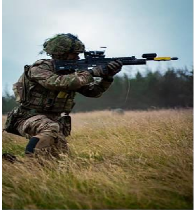
Initial contact on exercise